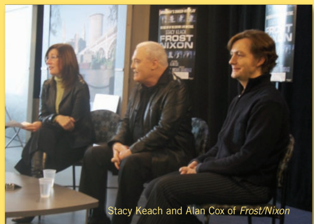
Stacy Keach and Alan Cox of Frost/Nixon